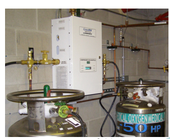
Genesvs™ manifold system