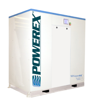
Medical Enclosed Scroll