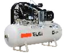
Oil lubricated recip 1.0 - 40 hp / 2.0 - 128 cfm