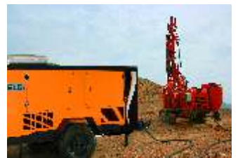
High pressure compressor for crawler drilling