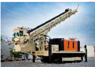
Blast hole drilling