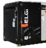
EN series rotary screw 2.2 - 45 kW / 9.0 - 280 cfm