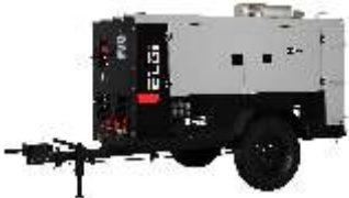
Diesel portable (Trolley) 185 - 1200 cfm / 100 - 350 psig