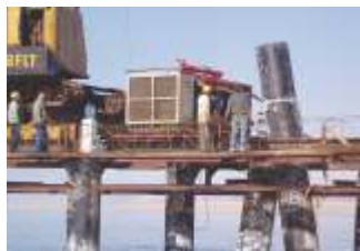
Mining in dead sea