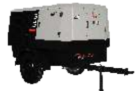
Electric portable (Trolley) 22 - 90 kW / 130 - 500 cfm