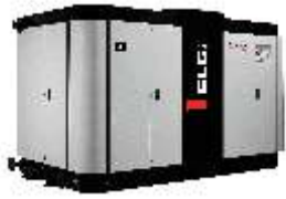
Oil free series screw 45 - 450 kW / 190 - 2601 cfm