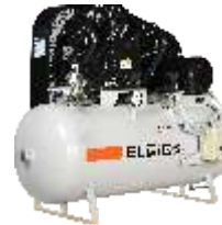
Oil free recip 5.0 - 30 kW / 14.5 - 90 cfm