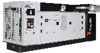
Diesel portable (Skid) 500 - 1500 cfm / 175 - 400 psig