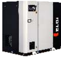
EG series rotary screw 11 - 250 kW / 45 - 1540 cfm