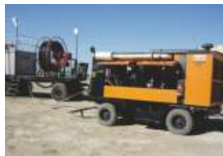
Uranium hole blowing